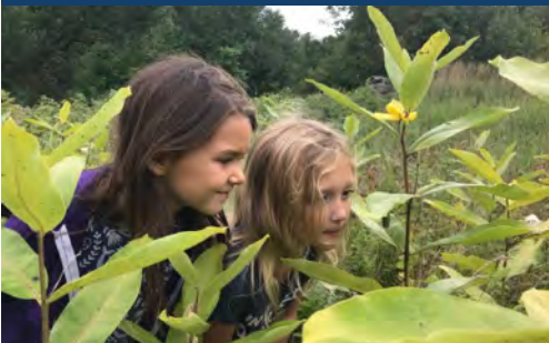
Children examine a monarch chrysalis during a butterfly tagging program.