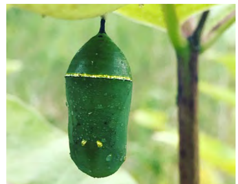
Monarch chrysalis on Sears Island.