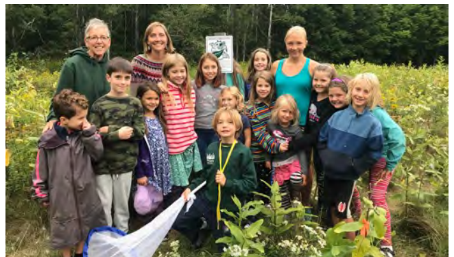
Science Squad participants during a monarch butterfly program on Sears Island (above) and at an animal bones discovery workshop (below).

We recently completed our first year of Science Squad, our new recurring monthly citizen science program for children. We finished out the year strong, having served 220 participants in 9 programs during the months school was in session. This fall we offered a monarch tagging workshop for families, an animal bones discovery workshop, and a nature journaling and observation program. Due to the positive feedback and high attendance numbers we've seen at these programs, we decided to continue offering this program in 2019 using some leftover funds from our Davis Conservation Foundation grant as seed money. However, we need additional funds to keep the program running for the entire year. This innovative program connects local youth with scientific mentors, and engages them as citizen scientists, explorers, and stewards of their local environment. If you, or someone you know, would be interested in supporting Science Squad, let us know!