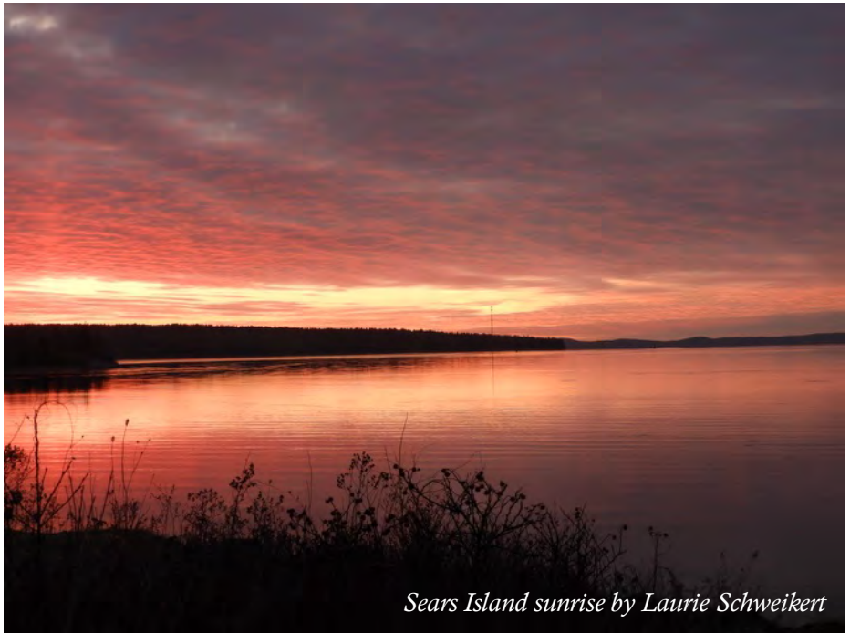
Sears Island sunrise by Laurie Schweikert