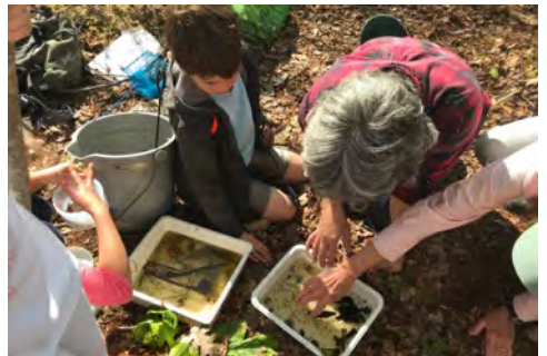
Science Squad vernal pool study.