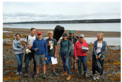
Maine Ocean School beach clean-up.